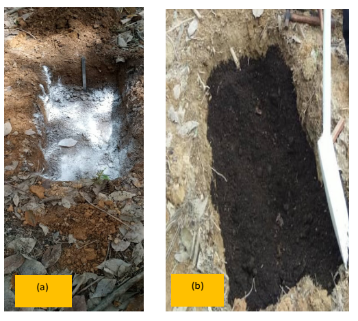
Figure 2. MPCPs (a) with GML and (b) bokashi applied

Note. The NPK (500 g) in treatments 5, 6, and 7 were added 3 weeks after the commencement of the research. The depth of the pits used was within the rooting depth of fine roots of rubber (0-30 cm) that are responsible for the absorption of nutrients and water (Huang et al., 2020). Except for the control-T4, all other treatments were applied through the conservation pits; GML = Ground magnesium limestone